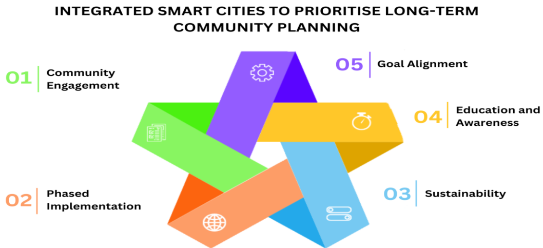
Figure 3: Integrated smart cities to prioritise long-term community planning

It is possible to look into a strategy that focuses on long-term community planning and smart city technologies in several different ways, such as through community involvement, phased execution, goal alignment, education and knowledge, and sustainability (Nahiduzzaman et al., 2021). It can mean that these places have built smart cities differently, even though they both use and make technology to improve services and the economy. Two types of structures were used in the two cities. The American cities used “participatory governance,” while the Chinese cities used a hierarchy model that emphasised the government’s controlling role and didn’t set up any planned ways for people to be involved. The goal of smart city projects in the United States was to get businesses to move to cities by building digital infrastructure and improving public services. The smart technology business is growing and getting more help from local Chinese governments. These governments are also taking care of the environment and building smart facilities. The central government has helped them with more policies and money (Nikki & Kim 2021). This particular writing focuses more on the discussion surrounding the community and sustainability. Figure 3 illustrates the Integrated smart cities to prioritise long-term community planning.