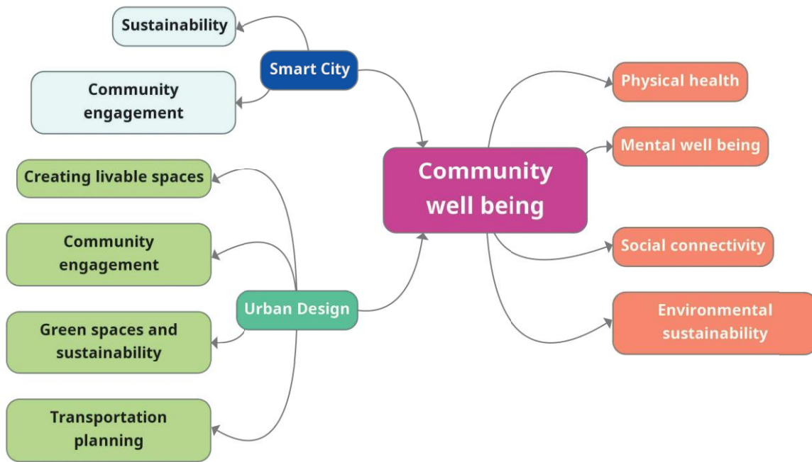
Figure 4: The relationship between Smart City, Urban Design and Community well-being

Community well-being generally focuses on urban people's overall quality of life. In contrast, urban design emphasises urban areas' physical layout and organisation to increase livability, and smart cities use technology to improve urban services and sustainability. These ideas are intricately intertwined and frequently collaborate to produce urban landscapes that are more dynamic, welcoming, and environmentally responsible.