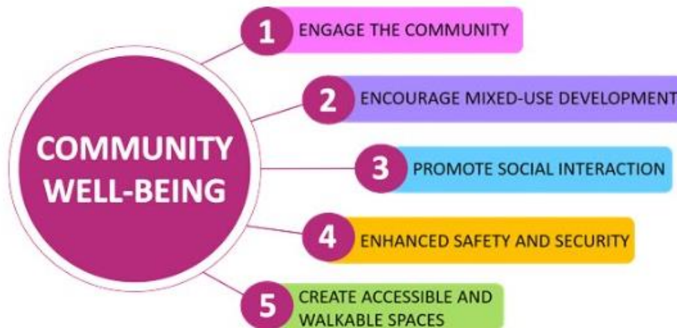
Figure 1: Establishment of a strong connection between community well-being and urban design

Sources: Chen et al., (2022); Jr, (2023); Kim & Jin, (2019)